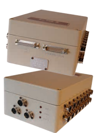
5001 Master Mux